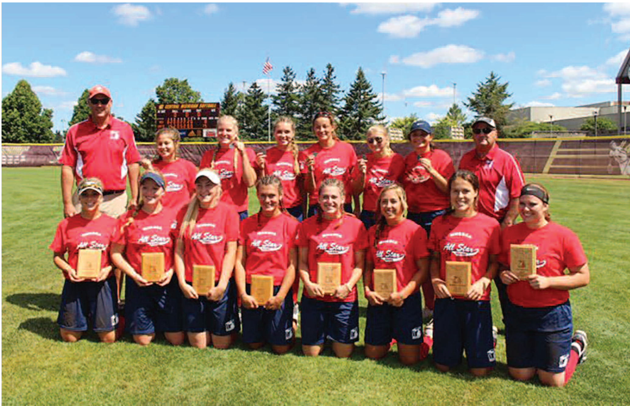
The Division 3 All-Star Red Team.