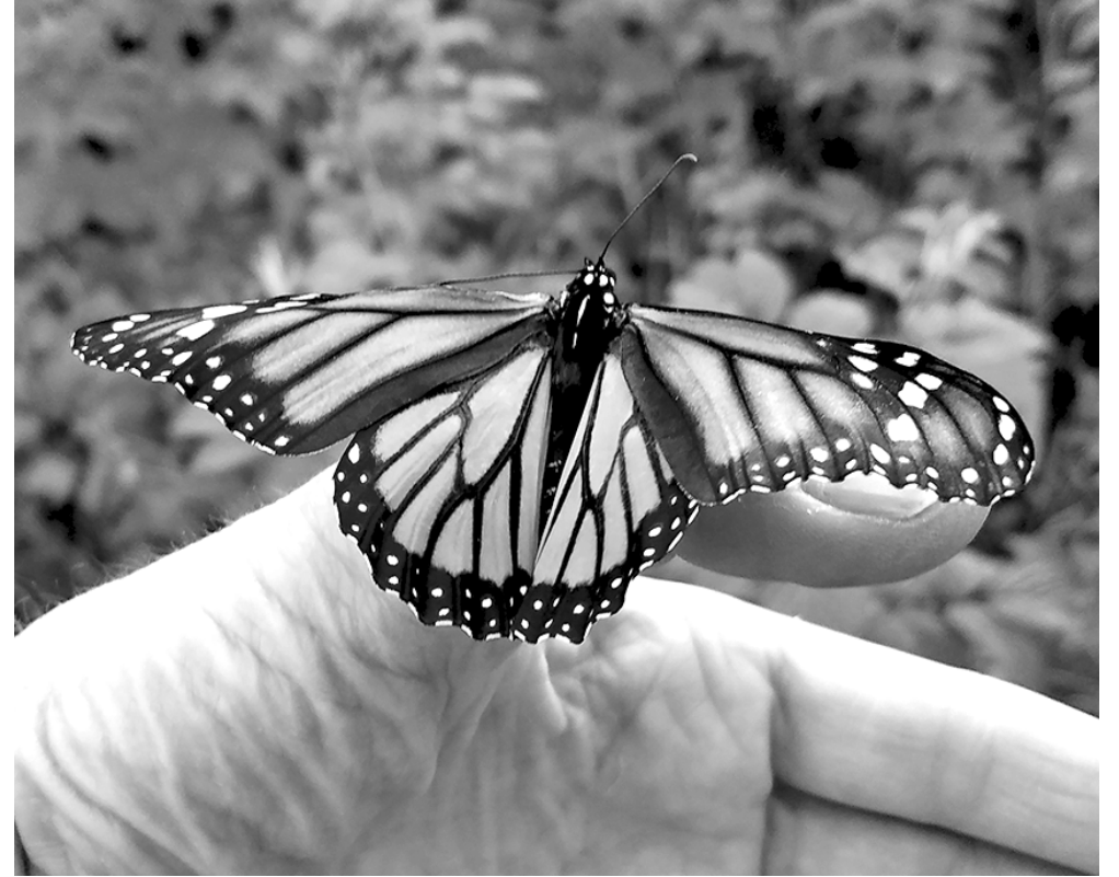
This Houghton Lake bullfrog appeared in front of me almost as if to say, "I'm ready for my close up!"