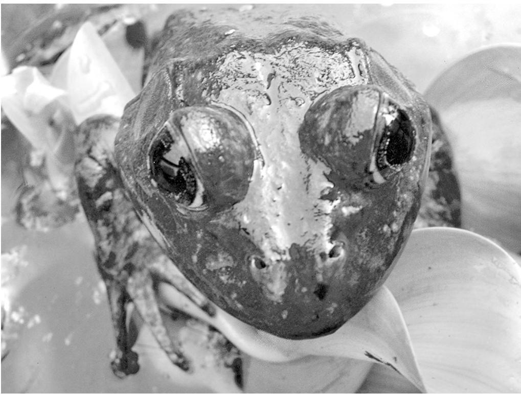
This Houghton Lake bullfrog appeared in front of me almost as if to say, "I'm ready for my close up!"

The warm, sunny weather this summer has made possible many opportunities to snap those camera shutters. Here are some captioned, camera conquests: